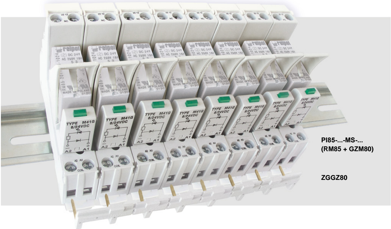
PI85-...-MS-... (RM85 + GZM80)