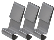
Hook x 3

3 hooks hold the elastic cord around the safety helmet.